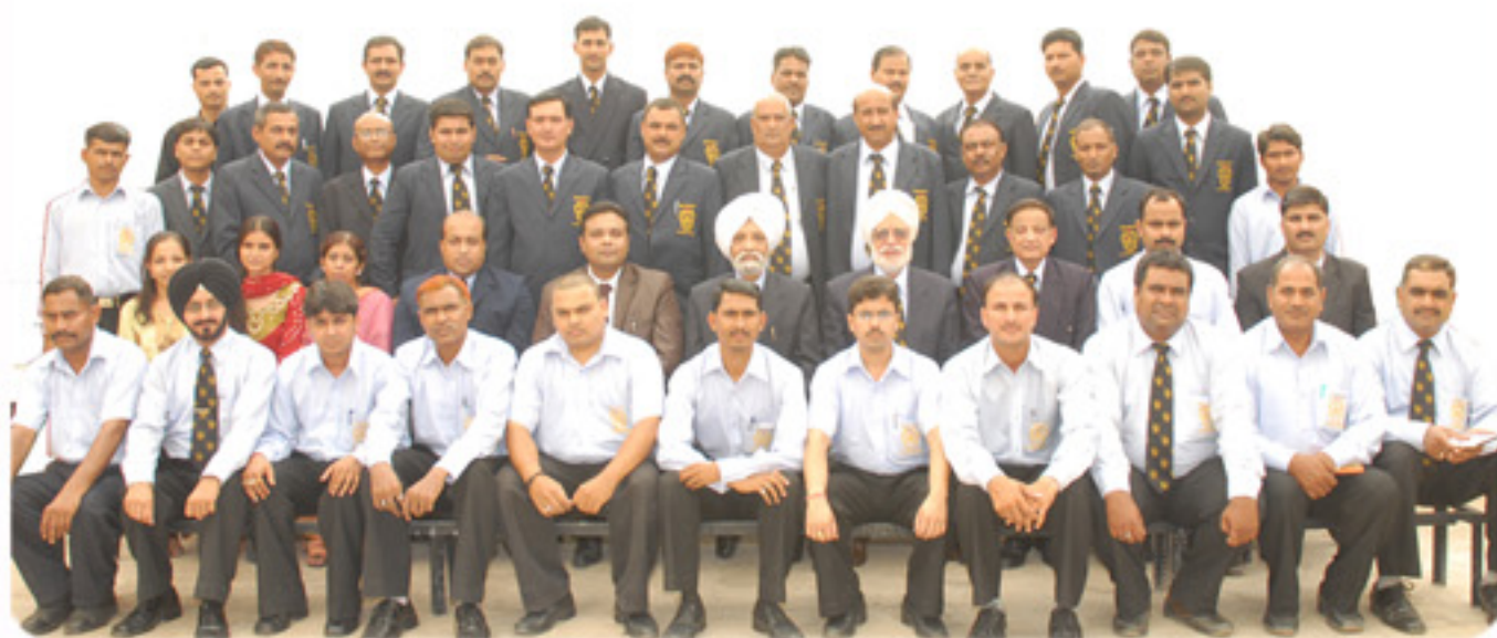
Our Corporate Staff