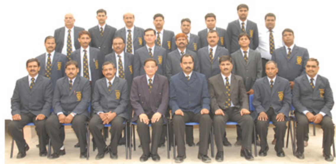
Our Operation Staff