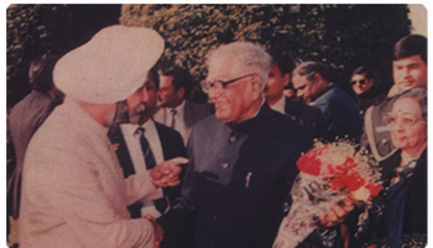
Hon'ble Shri R. Venkaraman